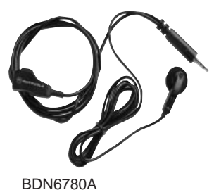
Pellet Style Earpieces BDN6780A Single Earbud with

BDN6719A Ear Receiver with 3.5 mm Threaded Plug, requires adapter BDN6676D unless being used with speaker microphone